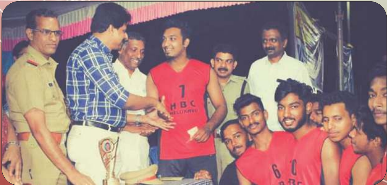
Runner up ( II Prize ) in the Volleyball tournament organized by Excise Department in association with Melukavu Grama Panchayath and Janamaithri Police under VIMUKTHI Programme on.....