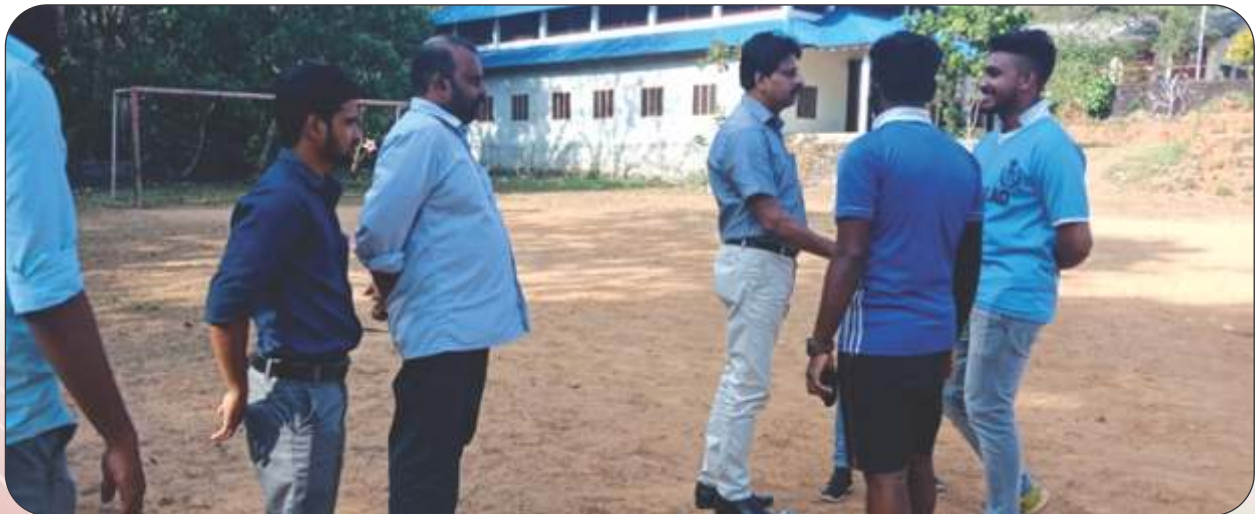
Football Championship Organized by College Union 2018-19 from 11/1/2019 to 13/1/2019 (36 teams attended). HBC Team bagged II Prize .