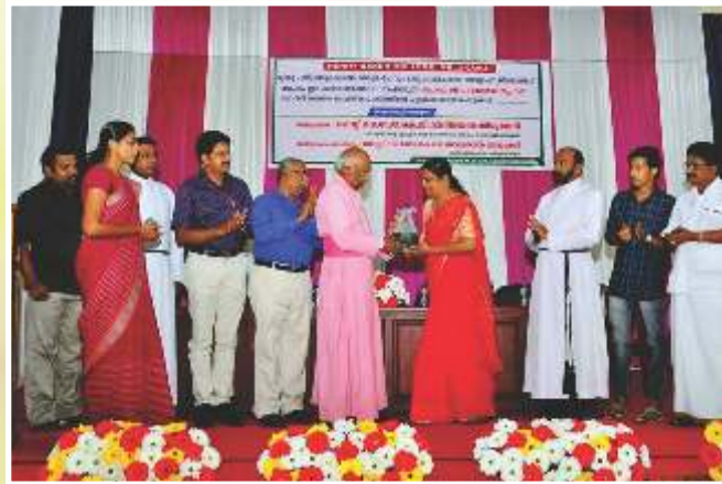
Henry Baker College, Melukavu, 27th June, 2018